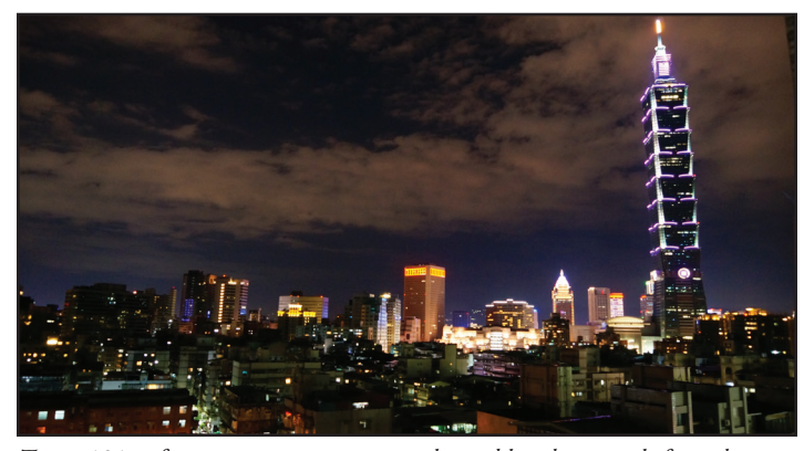
Taipei 101, a famous tourist attraction, is located less than a mile from the campus of Taipei Medical University. It rises high above the city's skyline as a testament to the bustling commerce and modern progress of Taipei.

The Lord's recovery is God's design, expressed through the truths of the Bible, to recover what Watchman Nee and Witness Lee described as the "normal Christian life" and the "normal Christian Church life". According to the New Testament, all believers are regenerated with God's eternal life and their spirits united in oneness with the Holy Spirit of God to become living members of the Body of Christ. Each believer is gifted in begetting, nourishing young ones, teaching scriptural truth, and building up the Body of Christ as one universal, corporate New Man, consummating the New Jerusalem. This is not a matter of doctrine; it is simply a new way of living, which is currently being practiced faithfully and joyfully by numerous brothers and sisters all over the world as they nurture each other's spiritual recovery through active participation in a local church community.