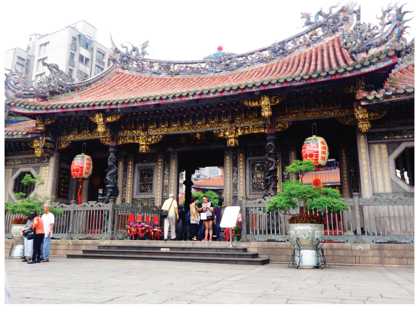
Longshan Temple, located in Wanhua, the oldest neighborhood in Taipei, is the spiritual heart of the city, representing the ancient history of the region.